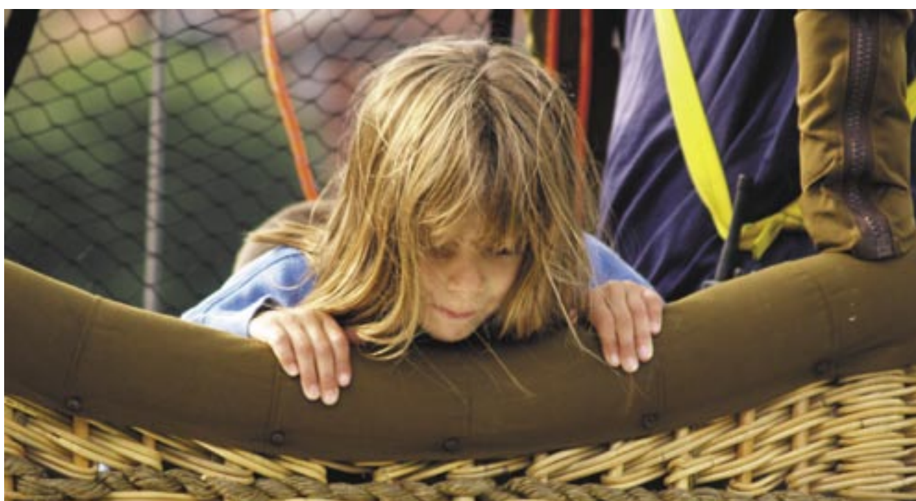
READY TO LAND: Young girl peers down as the balloon prepares to return to earth.